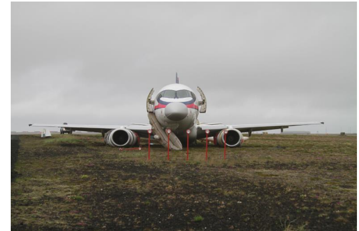
Figure 2: Field Deployment

The Icelandic Transportation Safety Board (ITSB) deployed two investigators to the accident site, which is also its total number of aviation accident investigators. The investigation revealed that for a large transportation accident investigations, the number of investigators is too scarce for the tasks at hand in the initial phases of the investigation. The investigators needed to be in multiple places, working multiple tasks, in the initial days of the investigation.