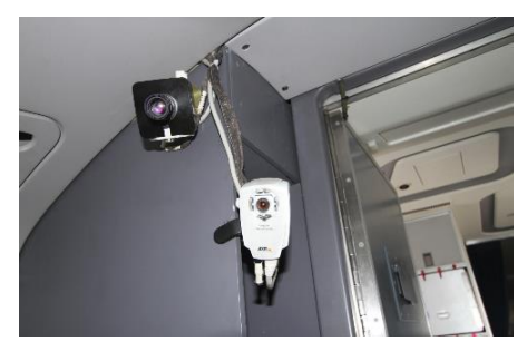
Figure 8: Cockpit RH side Video

There is no question about it, in the mind of the IIC of this investigation, the Airborne Image Recorder played a vital role in the investigation. The video image recordings it captured allowed the investigators to answer questions they would otherwise not have been able to answer in the investigation. In fact when the FDR failed to support the pilot's statement of activation of a go-around at the most critical moment of the test flight, a mere split of a second prior to the landing gears