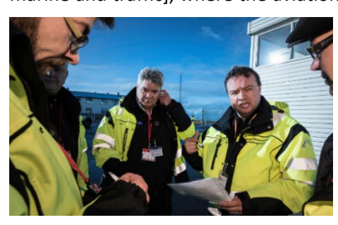
Figure 3: ITSB is Multimodal

marine and traffic], where the aviation division has also trained a group of rescue personnel in order to assist in case of a major accident. This group participates with the ITSB in a bi-annual training for a major aviation accident in one of the airports in Iceland. Furthermore, the three divisions (aviation, marine and traffic) of the ITSB have trained together in case where a mutual interest crosses the three units, such as when training with the governmental ID department.