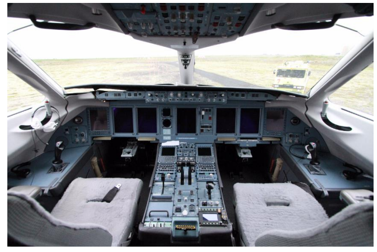
Figure 10: View of the Cockpit

As vital of a tool the Airborne Image Recorder has been shown to be, for