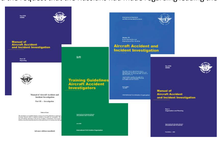
Figure 4: ICAO Annex 13

investigation. At the same time the IIC stated that ICAO protocol regarding Annex 13 would be upheld to its fullest to ensure correct procedures and a full participation of the Russian Federation through its ACCREP, as well as his advisors as needed. With this the tension that had started to build up, which was a valid one when considering the economic and political interests the Russian Federation had in this accident, faded away.