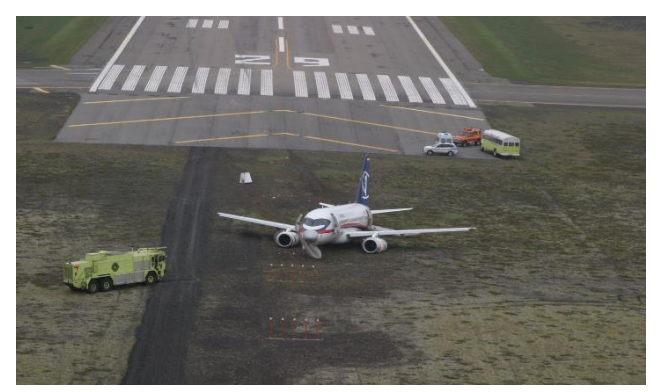
Figure 1: The Accident Site

critical [right] engine shut down and crosswind exceeding 10 m/s (19.5 knots). For safety of this test, the landing gears were to be in the down and locked position during the final approach, until the aircraft had initiated the go-around and gained a positive rate of climb. The aim was to collect test data needed for the extension the aircraft's approval from CATII certificate to CAT IIIA certificate, which required flight tests to show compliance with EASA CS-AWO 140, Approach and Automatic Landing with an Inoperative Engine.