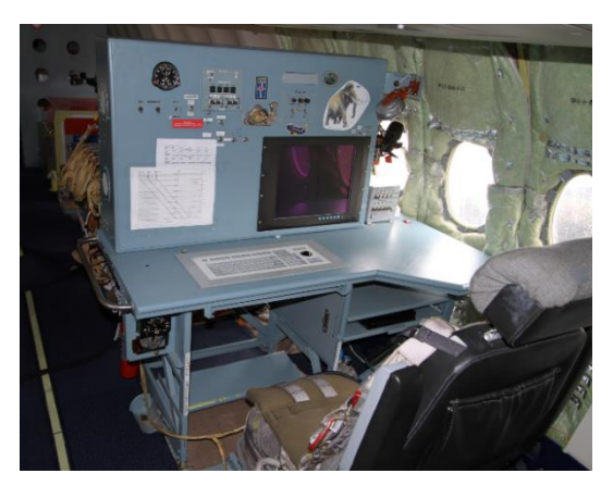
Figure 6: Inflight Data Collection

Finally, for the first time [to the ITSB knowledge] in the case of an accident of a large transport category aircraft, airborne image recordings of the cockpit were